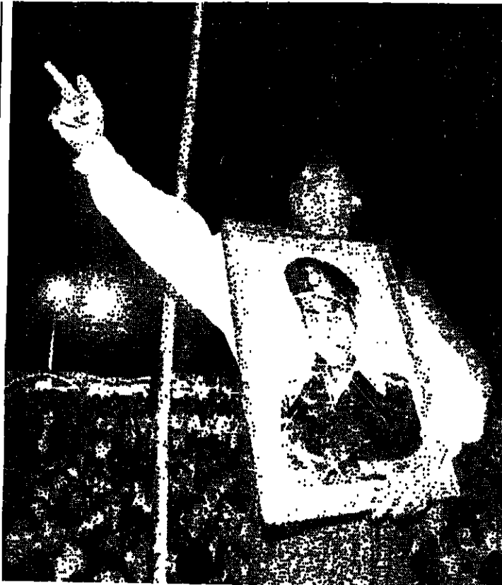
A student grips independence hero Aung San's portrait at a protest in Rangoon last week.

On Friday last week about 500 sat down at the intersection near the campus of Rangoon university. They